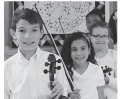
For the ninth year, Longwood was named a "Best Community for Music Education" by the National Association of Music Merchants Foundation.