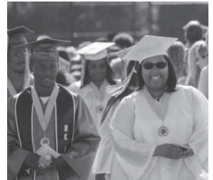
We are proud to announce a 97% graduation rate for the Class of 2017.