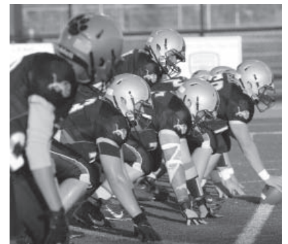
Our varsity teams qualify for the NYSPHSAA Scholar-Athlete Team Award by maintaining an academic average of 90 or above.

For a complete list of projects, visit our website at www.longwood.k12.ny.us .